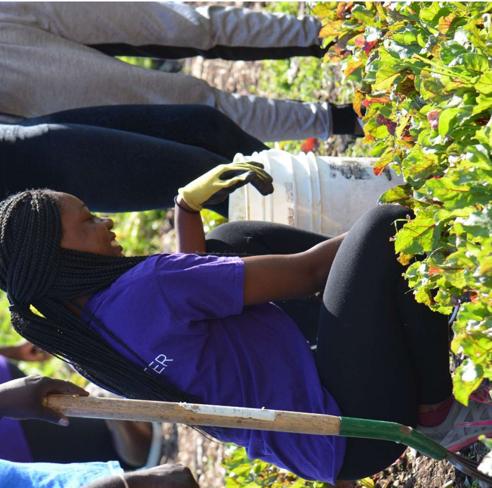
After-School Matters gardens in an Urban Growers Collective program in Chicago