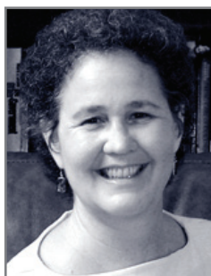
Linda Darling-Hammond Stanford University School of Education Leadership “enables teachers to be effective.”

Kati Haycock, the head of the Washington, D.C.-based advocacy group Education Trust, is known as an engaging sermonizer about the crucial connection between high-quality teaching and educational equity. But at a national conference in New York in fall 2007, she emphasized the role of leaders. “The most devastating lessons in the education of poor children and children of color