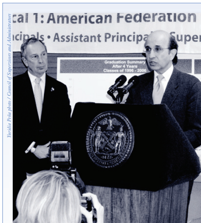
New York City Schools Chancellor Joel Klein at a press conference with Mayor Michael Bloomberg. Klein presides over the largest school district in the United States at a time when mayors are asserting themselves in the leadership and governance of school districts.

The comings and goings of superintendents are big community news. The school district is often the largest employer, and its reputation affects real estate values, the local job market and, not incidentally, the futures of most of a community's children. So what superintendents say and do garners headlines, whatever the subject. But journalists should always ask themselves whether they – and their audience – know what the superintendent sees as the most pressing educational challenges. They should also