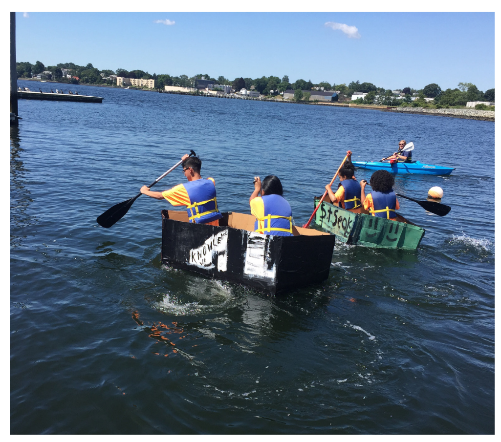
Providence After School Alliance AfterZone youth race cardboard boats they designed and built during Save the Bay's Explore the Bay program.