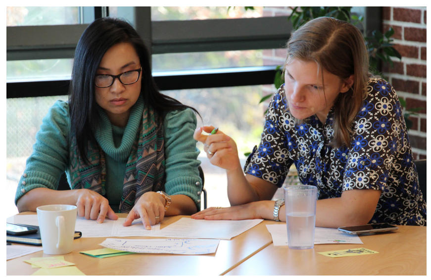
Youth workers discuss priorities based on feedback from the Sprockets network (St. Paul).

Solution: To cut costs, the intermediary decided to shift to a model whereby program staff would observe and rate their peers. The challenge now was to ensure that the observations continued to produce timely, reliable data. This meant developing a pipeline to recruit, select, train, and certify the observers and, if necessary, retrain them after the first round of observations. Training focused not only on how to properly observe and rate a fellow program but also on how to enter and process the data accurately and on time. This new approach calls for more communication and coordination than before, and as the intermediary continues to test out the approach, it will likely need to tweak its training and procedures.