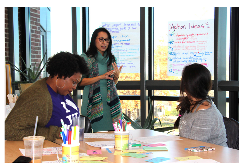
The Sprockets Community Advisory Council reviews network data to inform future engagement projects (St. Paul).

Everyone who plays a part in your data efforts needs to understand why data are relevant to their work, why accuracy is essential, and how to work with data the right way.