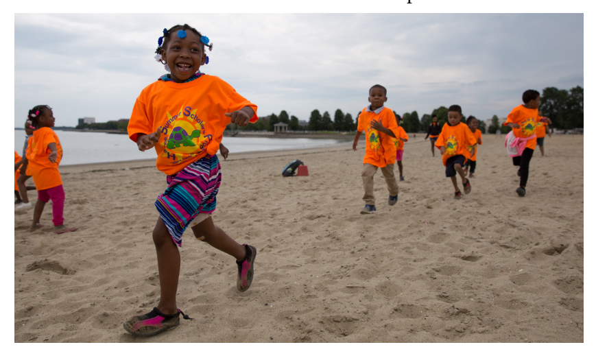
Students from Haynes Early Education Center enjoy the beach after using their scientific discovery skills with New England Aquarium staff (Boston).

The data coordinator should have some prior experience working with data, as well as ongoing professional development opportunities. Even intermediaries that work with an outside research firm or university can benefit from having a point person for data on staff. Your research partners can help with collecting, processing, analyzing, and reporting data, but you will need someone on your own staff with know-how in all those areas to make the most of what your partners can offer. The in-house data coordinator can act as a liaison to your research partners, making sure that the reports they provide meet your needs and helping staff and other stakeholders make sense of the information the reports contain.