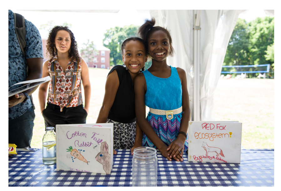
Students show off their final projects to friends and family at Thompson Island Outward Bound Education Center's summer program (Boston).

RAND researchers reviewed the quality of the data that the intermediaries in the three cities collect; the measurement tools they use; the condition of their databases; the way they store, process, and use data; and the resources—human, material, and financial—that they bring to bear on their data-related work. The review revealed a number of organizational, technical, and political challenges. Some are specific to individual cities and intermediaries, but others are likely shared by intermediaries across the country. These include how to decide what data to collect to meet the intermediary's goals, how to develop long-lasting policies and practices for collecting and managing data, how to use data in a timely and meaningful way, and how to examine connections among the data at system, program, and youth levels.