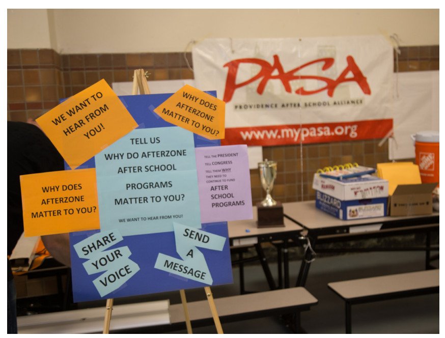
The Providence After School Alliance solicits feedback with a display board at a youth and family event.

information, to assign to each piece of data you intend to collect. If, for example, you are using a survey, checklist, or other instrument, the data dictionary should include a separate entry for each question, indicating the question number, what constitutes a valid answer (e.g., a scale of 1–5), and the name of the instrument (because the same answer, whether it is a number or a word, such as "rarely" or "sometimes," can have different meanings or values, depending on the instrument). The data dictionary should also specify variable type—whether it is "string" or text, such as "always, sometimes, or never" or numeric, such as having a value of 1–5, with the numbers clearly defined. You should also include the date the data were collected because some data points (e.g., age or grade level) change over time. See Table 2 for sample data dictionary entries.