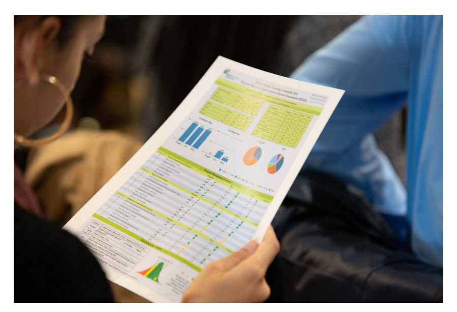
Program partners receive their Program Report for Improvement and System Measurement (PRISM) at Boston After School & Beyond's summer debrief.