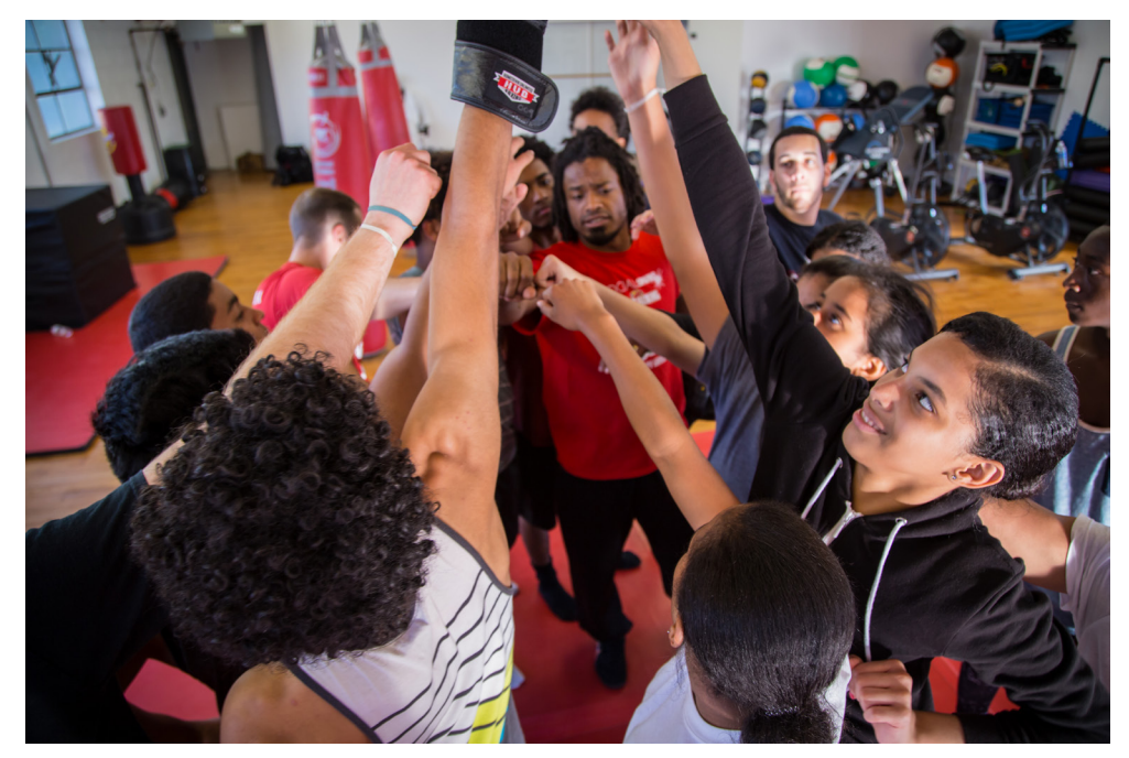
Members of ASTRO's Take CoMMAnd program gather as a team to close out their training (Providence).