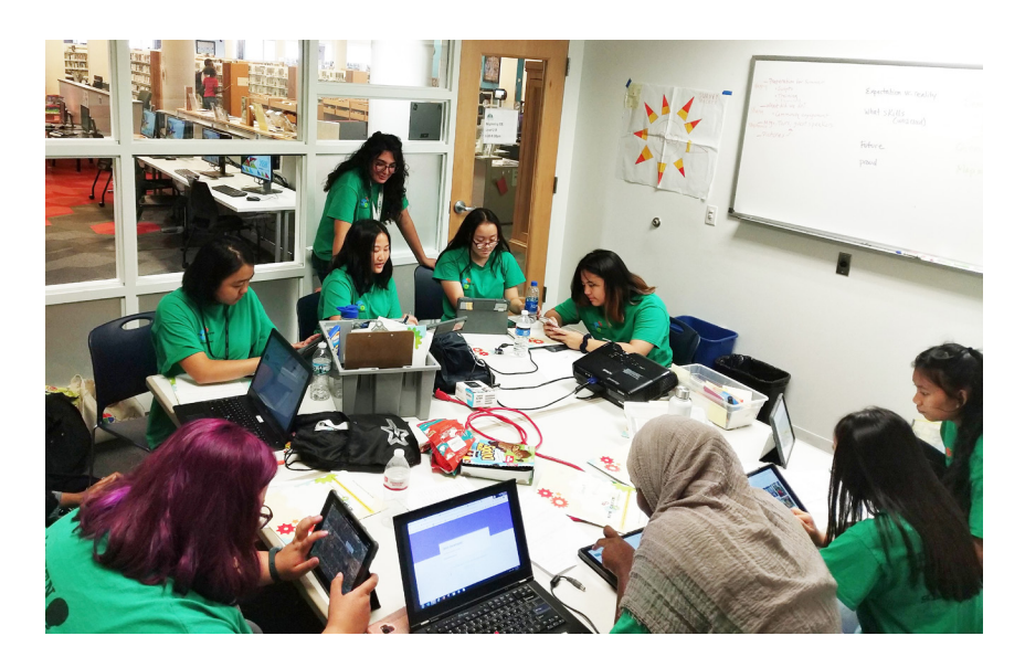
The Sprockets Community Engagement Team develops a group presentation using data from a citywide survey project on after-school access (St. Paul).

Solution: Each intermediary identified and articulated its goals for youth participation and outcomes, for program performance, and for the system as a whole. They then determined what data they would need to support those goals. All of the intermediaries emerged from this process with a renewed understanding of the purpose of their data efforts and how to communicate that purpose to stakeholders. One decided to drop certain data collection activities (e.g., reducing the number of student surveys administered), while another looked to pilot new ways of measuring youth outcomes.