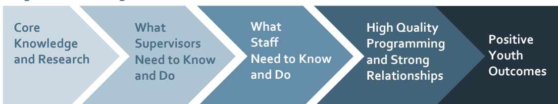
Figure 1. Achieving Positive Youth Outcomes

What do youth need from the professionals who work with them? They need caring relationships with adults they can trust. They need clear limits, high expectations, and healthy challenges. They need to be accepted for who they are. They need adults to support them in taking positive risks and avoiding negative ones. In short, they need you to be the very best you can be.