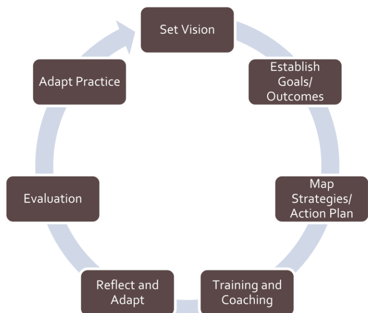
Figure 2. Continuous Improvement Cycle

Coaching is an ongoing process of teaching and reinforcing skills. A good coach helps practitioners adapt their new skills and knowledge to fit their own