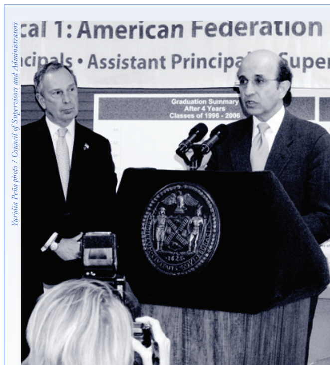
New York City Schools Chancellor Joel Klein at a press conference with Mayor Michael Bloomberg. Klein presides over the largest school district in the United States at a time when mayors are asserting themselves in the leadership and governance of school districts.

The comings and goings of superintendents are big community news. The school district is often the largest employer, and its reputation affects real estate values, the local job market and, not incidentally, the futures of most of a community's children. So what superintendents say and do garners headlines, whatever the subject. But journalists should always ask themselves whether they – and their audience – know what the superintendent sees as the most pressing educational challenges. They should also