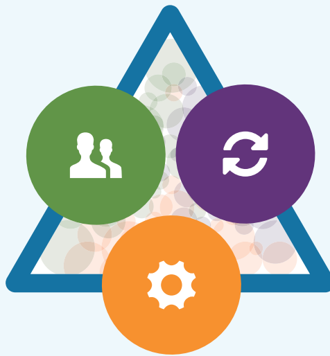
Figure 2: Aspects of a Data System Framework